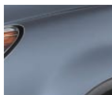
Atlantic Blue Pearl

† See owner's manual for detailed towing instructions.