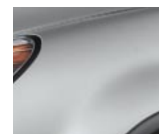
Titanium Silver Metallic