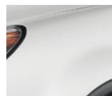
Satin White Pearl