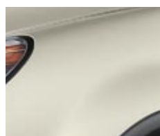
Champagne Gold Opal