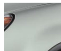
Seacrest Green Metallic