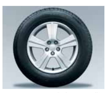
16-inch Aluminum Alloy (Convenience Package)