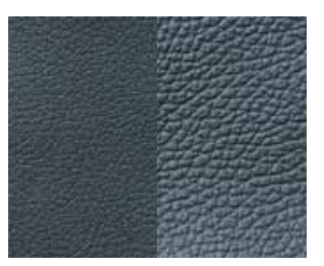
Onyx Black Leather