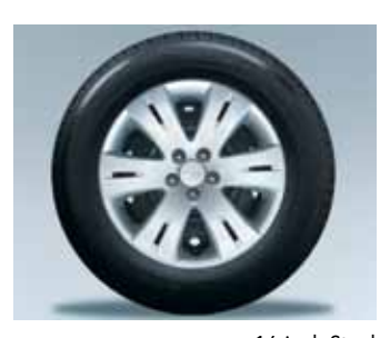
16-inch Steel (2.5X)