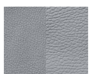
Platinum Grey Leather