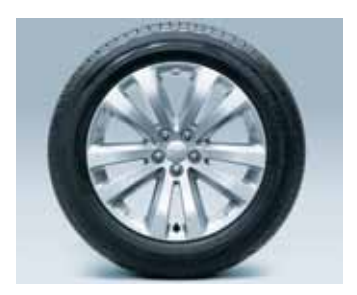
17-inch Aluminum Alloy (Touring Package, Limited Package)