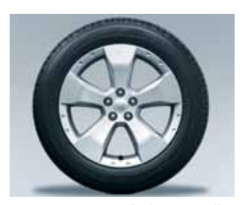
17-inch Aluminum Alloy (2.5XT Limited)