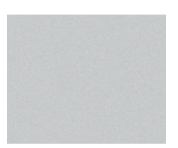
Ice Silver Metallic