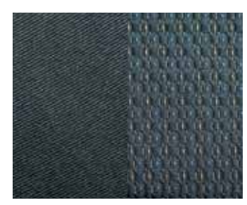
Onyx Black Cloth