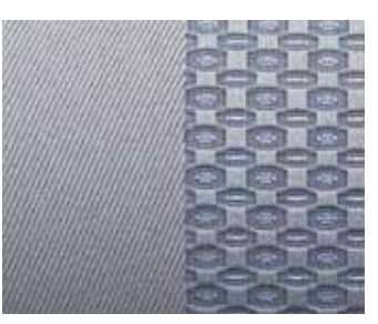
Platinum Grey Cloth