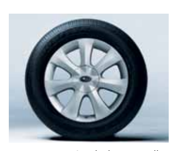
18-inch Aluminum Alloy (Limited Package, Premier Package)