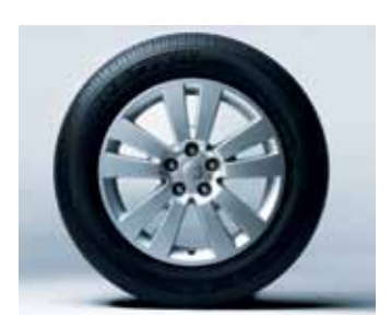
18-inch Aluminum Alloy (Tribeca)