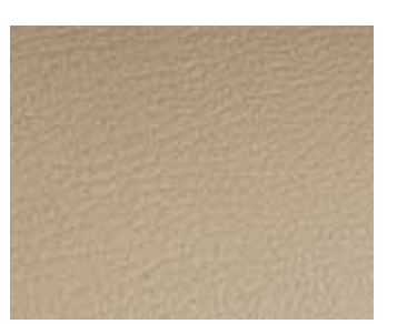
Desert Beige Leather