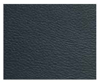
Slate Grey Leather