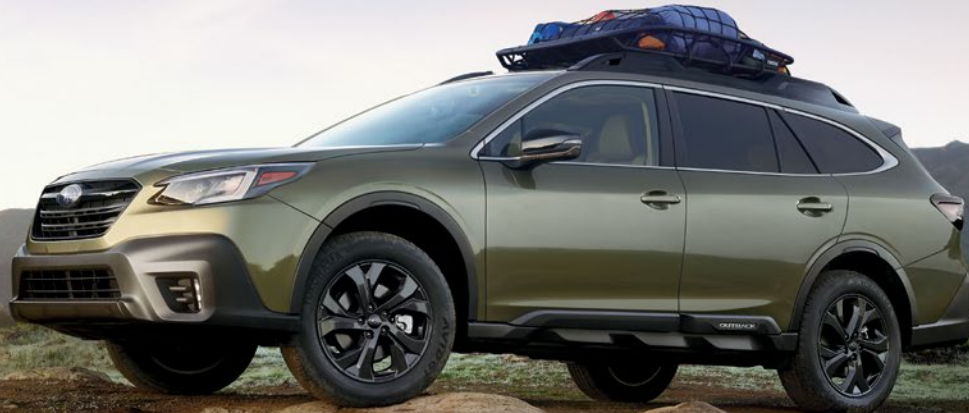
OUTBACK OUTDOOR XT

Completely redesigned for 2020, the all-new Outback is equipped for adventure both on and off pavement thanks to its car-like ride and handling and go-anywhere abilities that come standard on all Subaru SUVs, including Symmetrical full-time all-wheel drive and 220 millimetres of ground clearance.